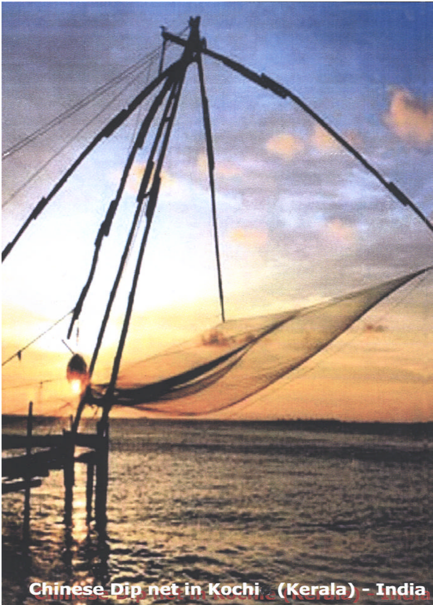
Chinese Dip net in Kochi (Kerala) - India